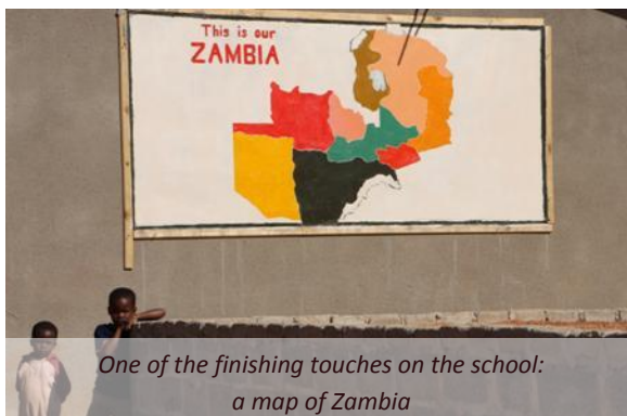
One of the finishing touches on the school: a map of Zambia