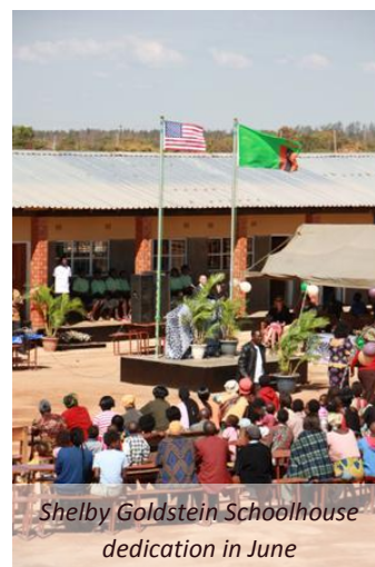
Shelby Goldstein Schoolhouse dedication in June

In a very exciting day during Spark's June Transformation Trip, the Shelby Goldstein Schoolhouse , which has been serving over 300 students since January, was officially dedicated in the presence of community leaders from around Zambia, members of the community around the school and leaders of both Spark and Hope.