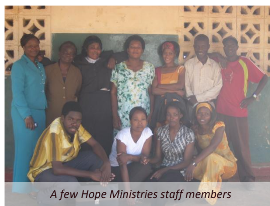
A few Hope Ministries staff members

There have also been many discussions about the land for the poultry farm project that will raise money for the school and orphanage. The Board of Directors has met a number of times to finalize the business proposal.